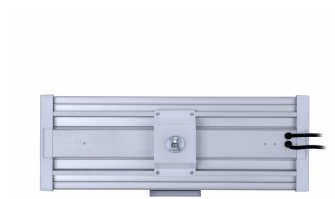
GreenUp Highbay G2 BY560P LED105 B